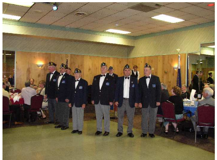
SEAFORD INSTALLATION OF OFFICERS