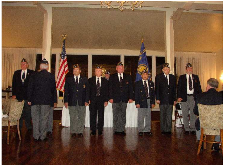
BAYVILLE INSTALLATION OF OFFICERS