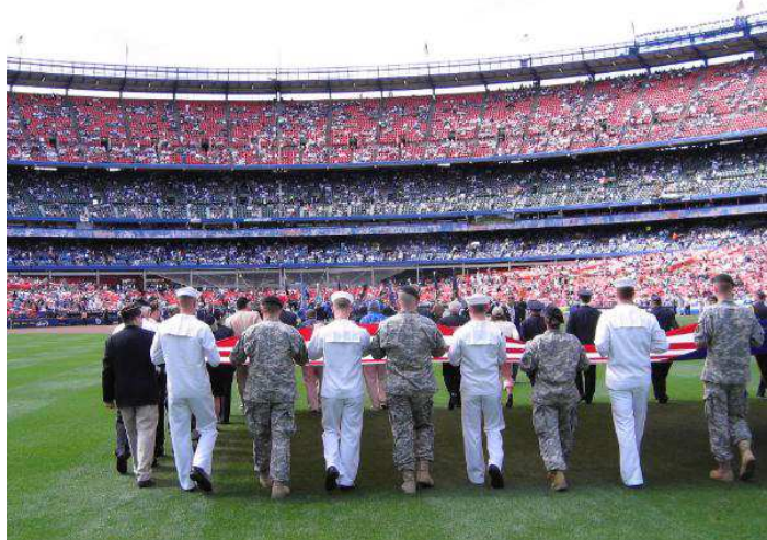
VETS HONORED AT SHEA STADIUM

MEMBER NATIONAL AMERICAN LEGION PRESS ASSOCIATION NEW YORK STATE LEGION PRESS ASSOCIATION