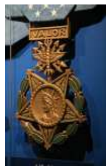
U.S. AIR FORCE