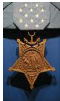
U.S. NAVY MARINE CORPS COAST GUARD