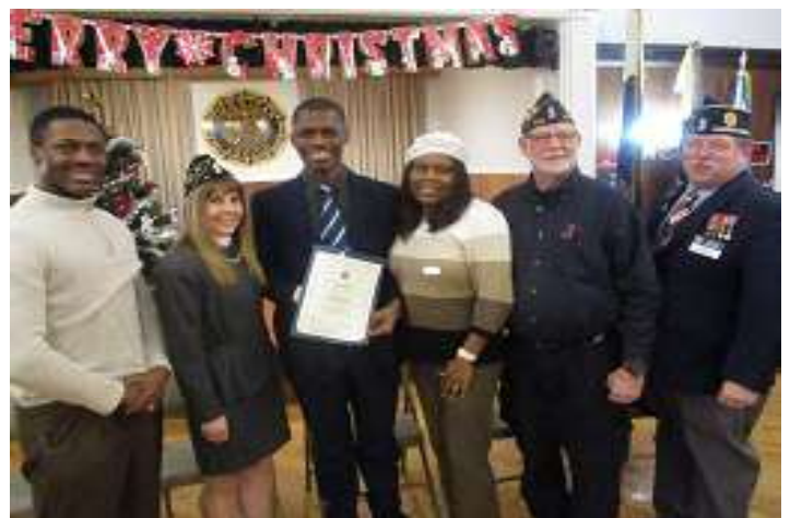
Contestants at Oratorical Contest at Malverne Post pose with County Commander.

WE WILL ALSO BE SETTING UP FOR MEMORIAL BENCHES AND MONUMENTS TO BE PLACED IN A LOCATION AROUND THE MAIN FLAGPOLE. MORE INFO TO FOLLOW.