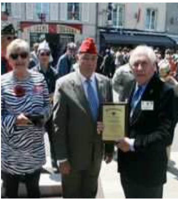
NATIONAL COMMANDER DAN DELLINGER AT D-DAY CEREMONIES NORMANDY FRANCE

THE FORM FOR THE NEW COUNTY DIRECTORY WAS INCLUDED WITH YOUR JUNE COPY OF THE LEGIONNAIRE. PLEASE FILL IT OUT AND RETURN TO ME AS SOON AS POSSIBLE. ALSO INCLUDED WAS AN APPLICATION FOR AN AD, PLEASE DON'T PUT IT ASIDE AND WAIT TILL THE LAST MINUTE. WE WOULD LIKE TO GET THE DIRECTORY OUT AS SOON AS POSSIBLE.