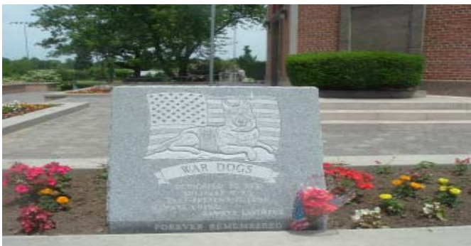
Monument to War Dogs at Eisenhower Veterans Plaza

I shipped out 65 phones right after the start of the New Year, they had a value of $56.05. I am awaiting receipt of that check. I received a check for $98.10 which I send to the County Treasurer and asked that it be divided between the Legacy Memorial Scholarship and the NEF. I picked up phones from the Town of Hempstead, and some that were dropped off at my house, these phones plus what I received tonight, will be shipped out early next week. The recycling company has requested that the minimum shipment be 50 cellphones. Keep collecting cell phones and bring the cell phones to the county meeting or if you have a large amount I will come to you to get them. A large amount is 25 or more, make it worthwhile for me to drive to where ever you may be. Your other option is to drop them off at my home.