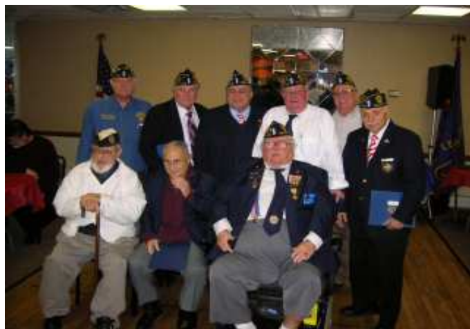
BALDWIN POST INSTALLATION

With funding from VA for the program, called Supportive Services for Veterans Families, community organizations will be better able to provide counseling, training, education assistance, direct time-limited financial assistance, transportation, child care, rent, utilities, and other services to participating Veterans and family members. In January, VA is sponsoring free grant-writing workshops for community organizations interested in applying for funds under this program. The workshops will be held in Chicago, Los Angeles, Seattle, Houston and New York City. When the "Notice of Funds Availability" applications are available, they will be posted on the VA Web site at www1.va.gov/homeless/ssvf.asp . Details about the workshops and other information about the program are available on the Internet at www1.va.gov/homeless . Community organizations can also contact VA at 1-877-737-0111 or at SSVF@va.gov . [Source: VA News Release 16 Dec 2010 ++]