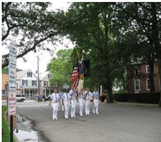
NASSAU COLOR GUARD AT OYSTER BAY