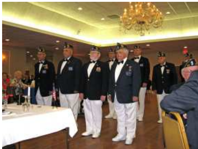
NASSAU COUNTY INSTALLATION WILLISTON POST

START PLANNING NOW FOR YOUR POST LEGIONNAIRE OF THE YEAR PROGRAM. THAT STARTS THE PROCESS FOR OUR COUNTY PROGRAM. THOSE NOMINATED LAST YEAR ARE ELIGIBLE TO BE NOMINATED AGAIN FOR THIS YEAR. THE FORMS AND INSTRUCTIONS WILL BE SENT OUT IN OCTOBER.