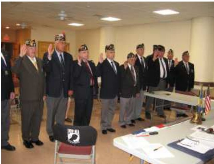
COMMANDER INSTALLS THE ELMONT POST