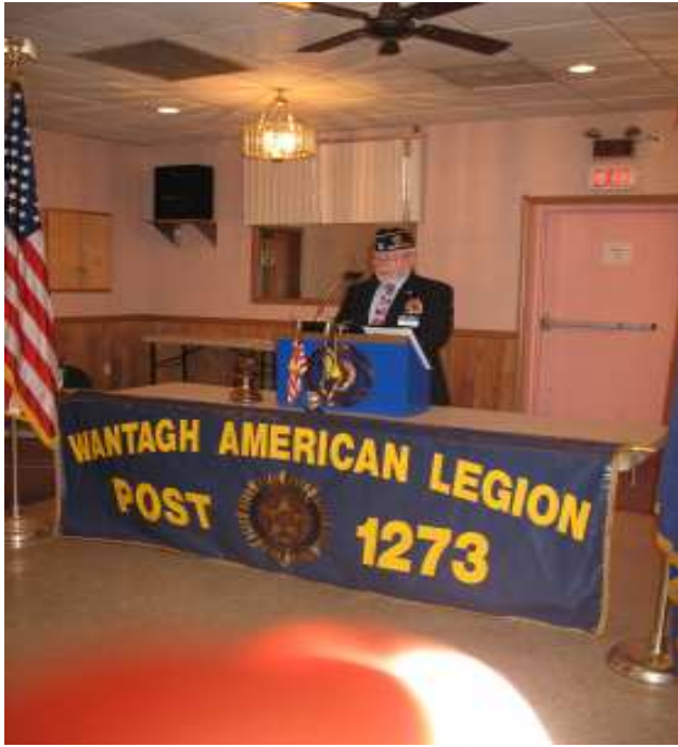
COMMANDER INSTALLS WANTAGH POST OFFICERS