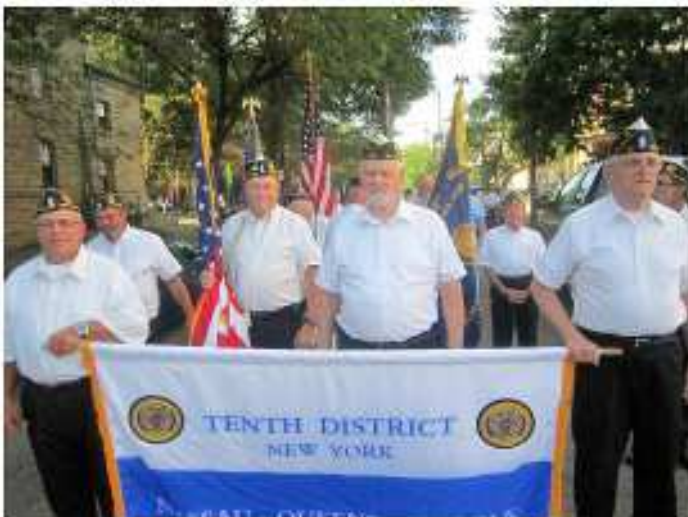
TENTH DISTRICT AT DEPARTMENT CONVENTION IN

THESE 10 POSTS ARE OVER DUE AND WILL BE CONTACTED FOR THE PROPER INFORMATION.