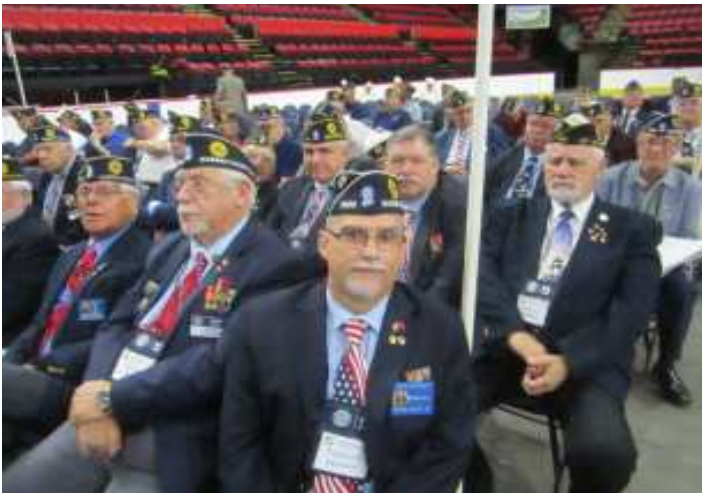
NASSAU COUNTY DELEGATION AT BINGHAMTON CONVENTION