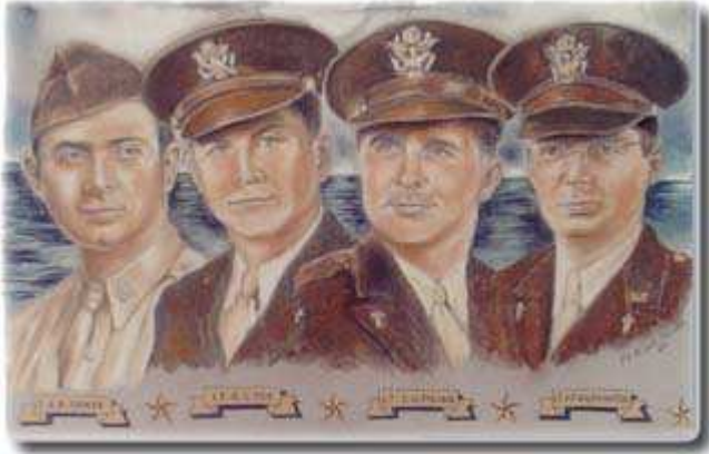
NASSAU COUNTY FOUR CHAPLAINS BACK TO GOD SERVICE SUNDAY, FEBRUARY 3, 2008

MEMBER National American Legion Press Association New York State Legion Press Association