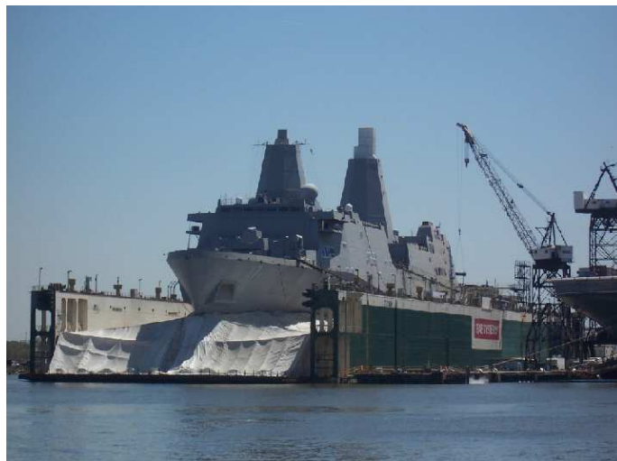
USS New York In Dry Dock Getting Fitted

Hope you have had your mammography this year. Make sure you tell your relatives and friends to have theirs taken. Sadly to say my young niece just found out she has breast cancer. Hopefully she will be OK. She is my sisters second daughter to have breast cancer. Sadly, my sister passed away with breast cancer in 1980. With early detection the percentage of breast cancer survivors is getting higher.