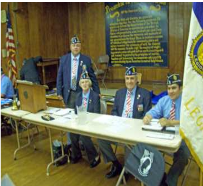
NASSAU COUNTY OFFICERS AT THEIR FIRST COUNTY MEETING OF THE YEAR AT HEMPSTEAD POST 390