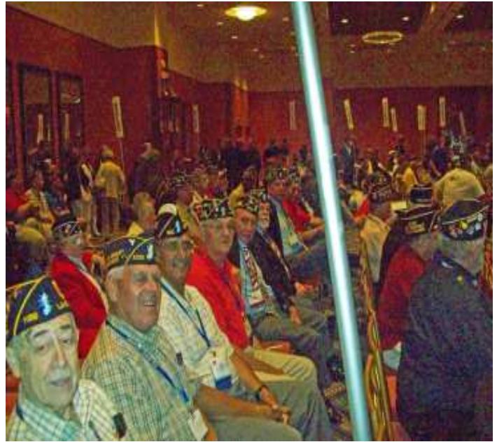
NASSAU COUNTY DELEGATION AT THE DEPARTMENT CONVENTION IN SYRACUSE, NY.